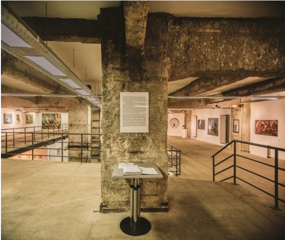
1) YermilovCentre (Kharkiv)

YermilovCentre is the first contemporary art space in Kharkiv, Ukraine's second largest city and former capital. The Centre aims to promote contemporary visual arts in the region, stimulating dialogue and exchange between artists. The Centre runs a big exhibition space, part of the N. Karazin Kharkiv National University, which has an active annual programme showcasing the best of new local and national talent. The Centre houses residence programme and provides a unique point of access to Kharkiv's rich, multifaceted –and largely unknown- visual arts' culture.