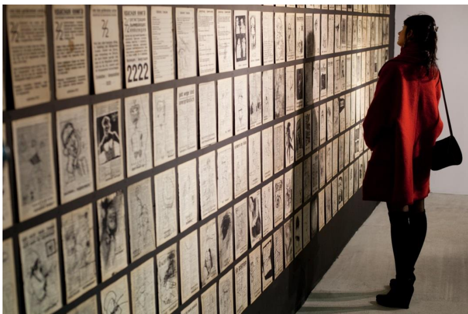
NonStopMedia Festival/Kharkiv Municipal Art Gallery (Kharkiv)